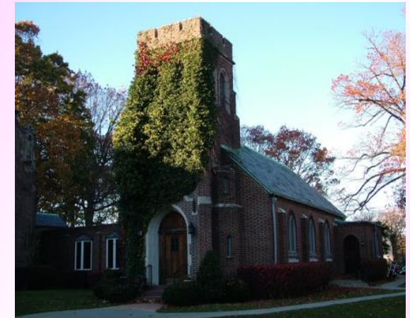
Sacred Heart Chapel