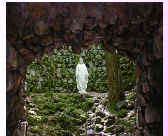
Sacred Heart Grotto